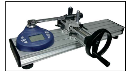
Testing TTC with Internal Sensor