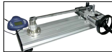
Testing TTC with External Sensor