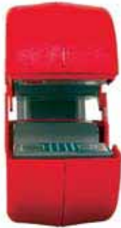
The smooth head surface eliminates build up of foreign particles and improves reading accuracy.

The ergonomic body design permits one-handed operation. The guard provides additional strength, and prevents the hand from slipping or coming into contact with conductors under test. The LCD lens cover may be easily replaced if scratched. The sealed push-buttons directly access all test functions and are easily operated even with gloved hands.