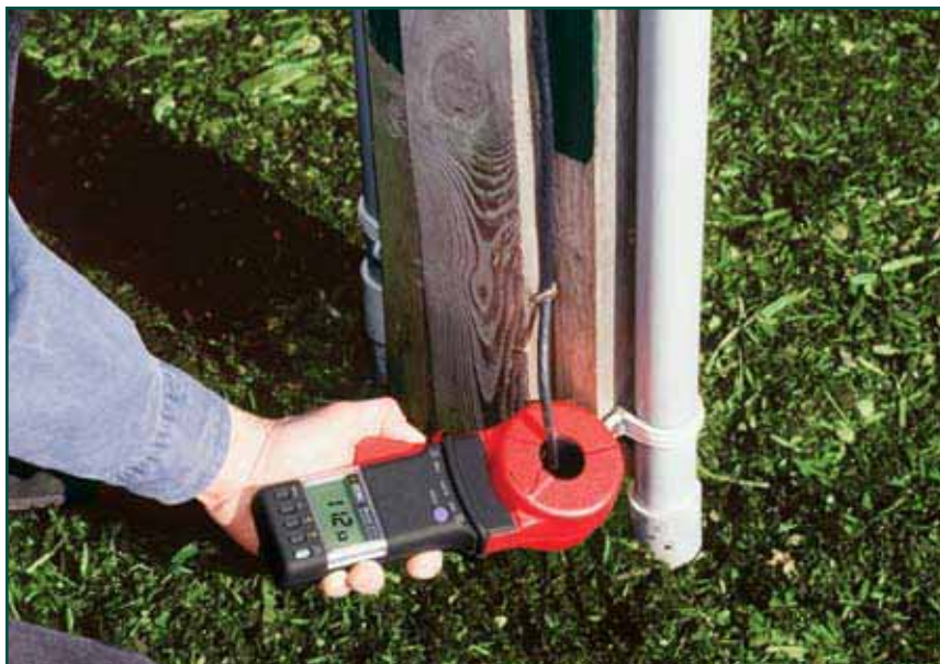
Model 3731 performing a ground rod resistance check.

The Models 3711 and 3731 measure ground rod and grid resistance in any environment without the use of auxiliary ground rods. Clamp-on ground resistance testers are used on multi-grounded systems without disconnecting the ground under test. The Models 3711 and 3731 simply clamp around the ground conductor or rod and measures the resistance to ground fast and accurately.